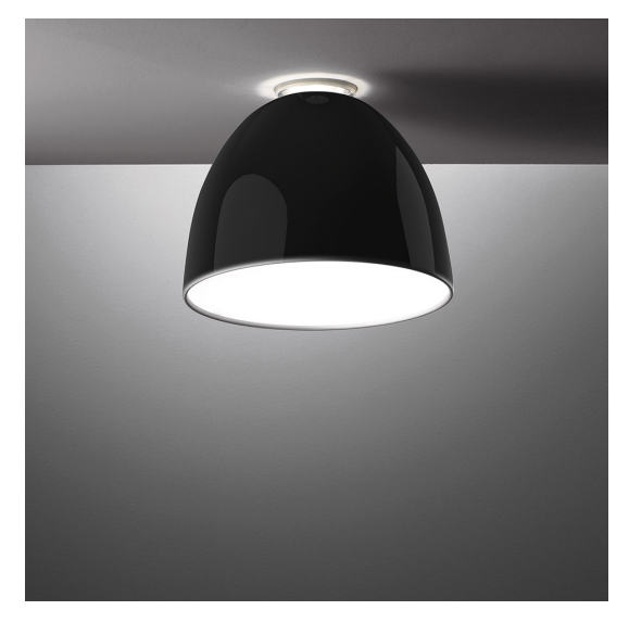
IP 40 (⊕) (■) (■) (■) (■) Dimmerable: +① -